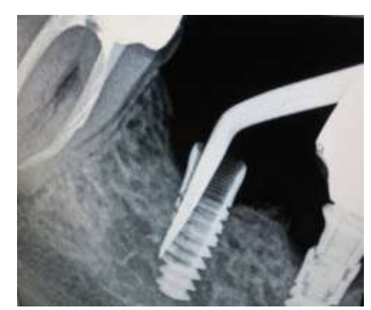
Fig 6: Perforation during preparation