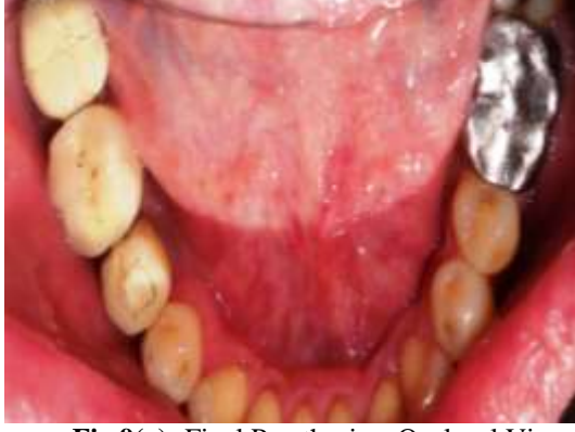
Fig 9(a): Final Prosthesis – Occlusal View