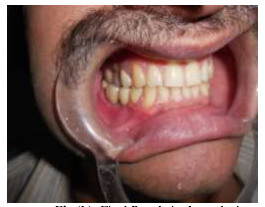
Fig (b): Final Prostheis- In occlusion