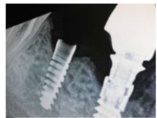
Fig 4(b): Post space preparation –radiographic view