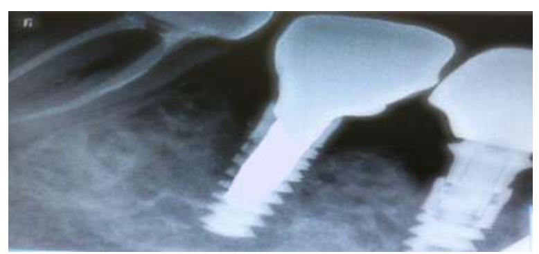
Fig 10: Recall Post Operative radiograph