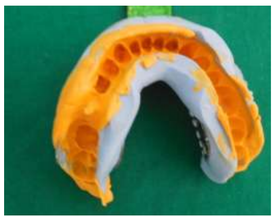
Fig 5: Post space preparation