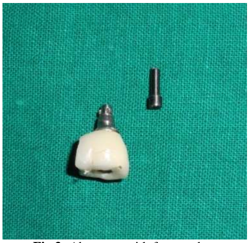
Fig 3: Abutment with fractured screw